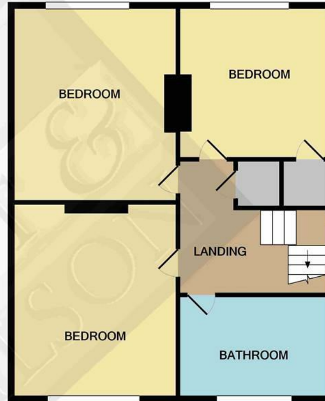
1ST FLOOR APPROX. FLOOR AREA 633 SQ.FT. (58.8 SQ.M.)

TOTAL APPROX. FLOOR AREA 1350 SQ.FT. (125.4 SQ.M.)