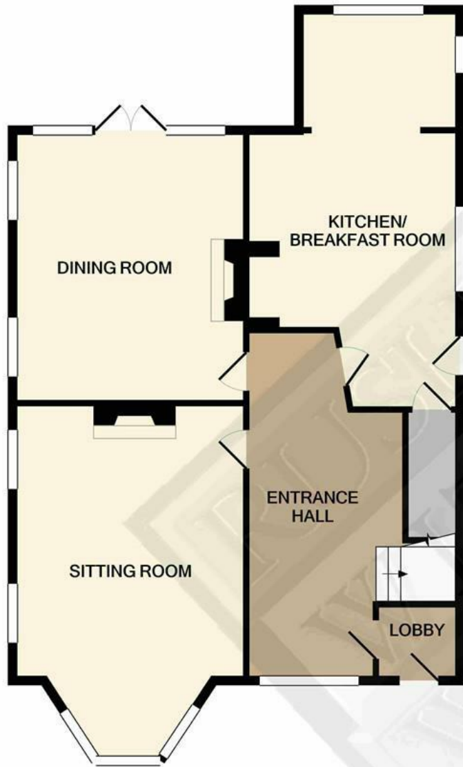
GROUND FLOOR APPROX. FLOOR AREA 718 SQ.FT. (66.7 SQ.M.)